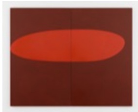
Suzan Frecon vermilion , 2017 Oil on linen Overall: 84 1/8 x 104 x 1 1/2 inches 213.7 x 264.2 x 3.8 cm Each panel: 84 1/8 x 52 x 1 1/2 inches 213.7 x 132.1 x 3.8 cm Signed verso FRESU0350