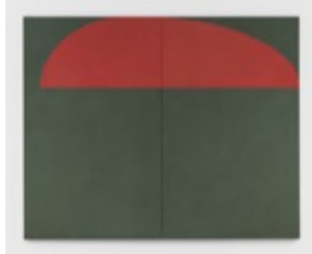
Suzan Frecon noh , 2017 Oil on linen Overall: 84 1/8 x 104 x 1 1/2 inches 213.7 x 264.2 x 3.8 cm Each panel: 84 1/8 x 52 x 1 1/2 inches 213.7 x 132.1 x 3.8 cm Signed and titled verso FRESU0353