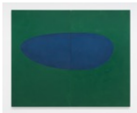
Suzan Frecon lapis lazuli nicosia , 2017 Oil on linen Overall: 84 1/8 x 104 x 1 1/2 inches 213.7 x 264.2 x 3.8 cm Each panel: 84 1/8 x 52 x 1 1/2 inches 213.7 x 132.1 x 3.8 cm Signed, titled, and dated verso FRESU0355